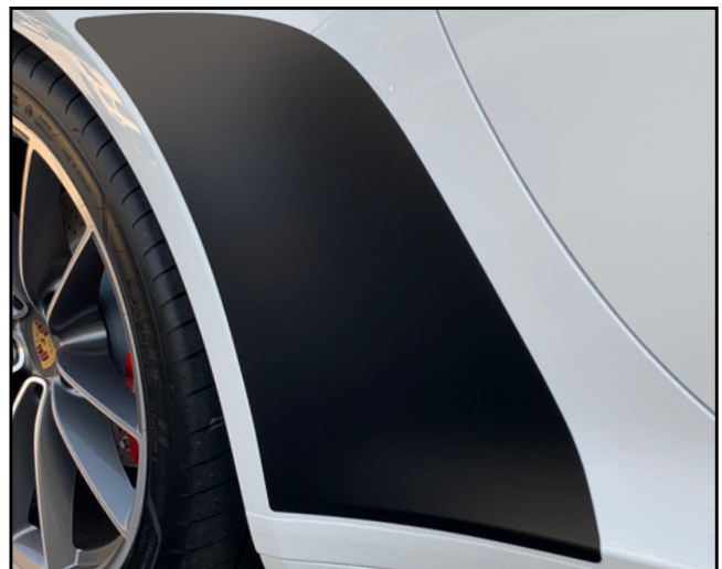
Appendix B - Final Result - Precision Fit to Original Stone Guard